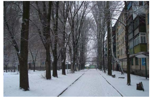
Last blast of winter???