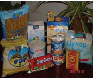
Monthly food packet

Please consider making a donation to help continue this worthwhile program.